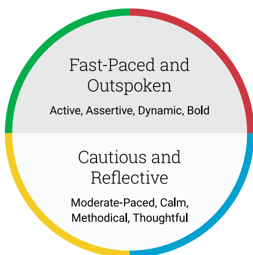
VERTICAL DIMENSION: CAUTIOUS-BOLD